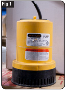
PUMP USED WITH FRESH WATER