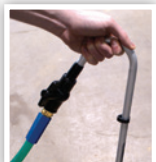
USE AS A HANDLE OR ATTACH TO ANY HOSE