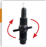
REGULATE WATER VOLUME