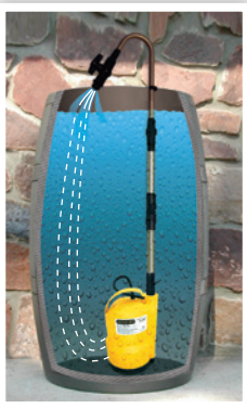
USE AS A WATER AERATOR

Mondi™ Water Pump Extensions act as water and organic tea aerators, flow regulators, and handles. They can be used to add oxygen to water and organic tea in rain barrels and reservoirs. A ball valve also regulates the water flow to suit your needs. Mondi™ Water Pump Extensions feature an ergonomically designed aluminum bend that acts like a handle, allowing you to safely move the connected pump from rain barrels or reservoirs without having to hold it by the electrical cord or hose. They come with three pieces that can be easily connected to one another with locking collars to a maximum length of 42" and can be used with any pump or hose fitting.