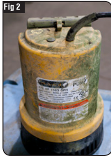
PUMP USED WITH CORROSIVE WATER