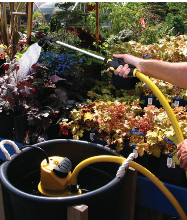
Monditech™ 1585X used with Monditech™ Telescopic Watering Wand

M onditech™ Products Ltd. is a leading manufacturer of innovative products for commercial and hobby growers alike throughout the world. Constructed with the best materials, our line of gardening tools and accessories assures gardeners will achieve unparalleled results. Monditech™ also provides some of the industry's most comprehensive warranties to ensure you receive high value with your selection. Simply put, we're here to help gardeners realize their full potential.