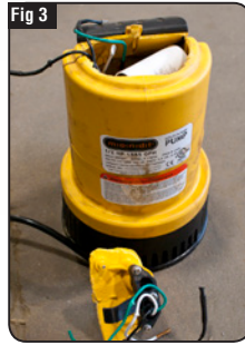
PUMP THAT'S BEEN MISTREATED AND BROKEN